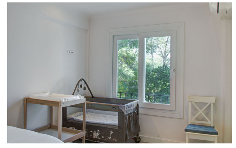
Second bedroom with baby crib.